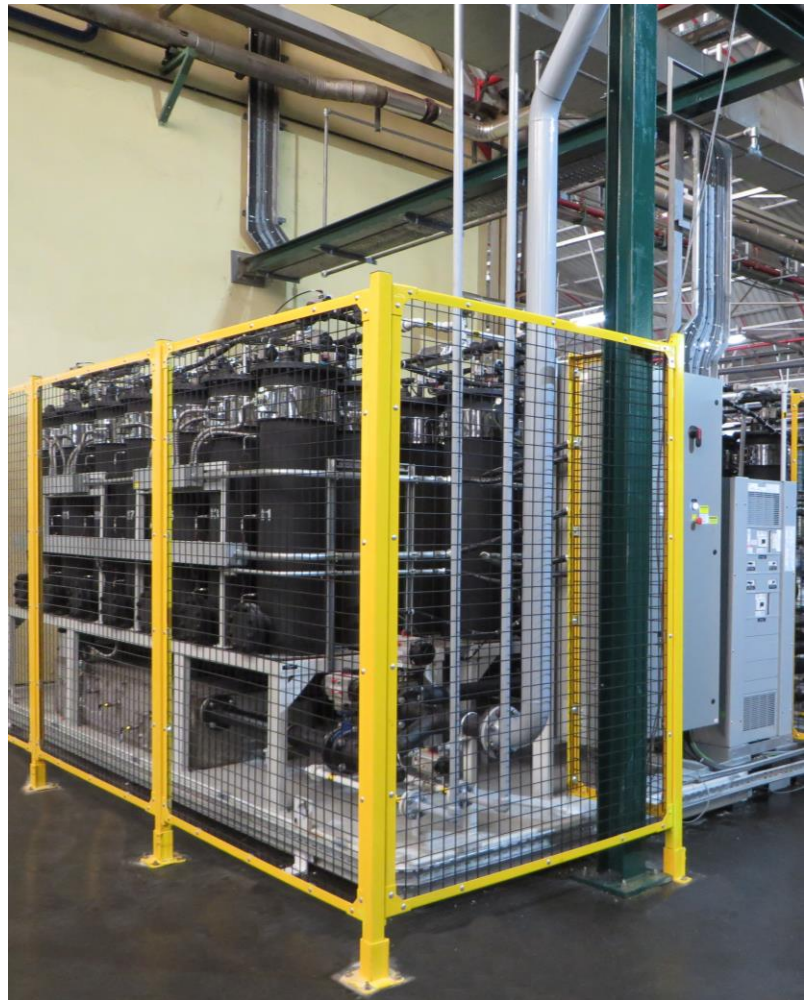
Skid Mount Option